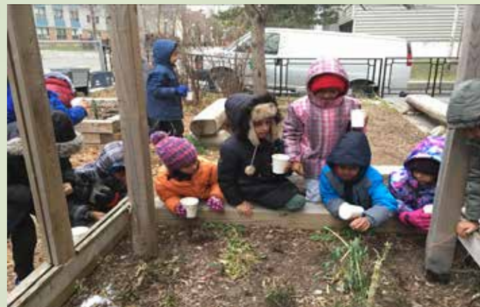
collecting seed at Rose Ave. PS garden

Garden Program Participants said: "I'll help make the food, but I won't eat it because I don't like vegetables". However, after he helped his peers make the kale pesto and he tasted it, he asked, "Can I have more pesto, please?" - Grade 1 student, Blake St. PS