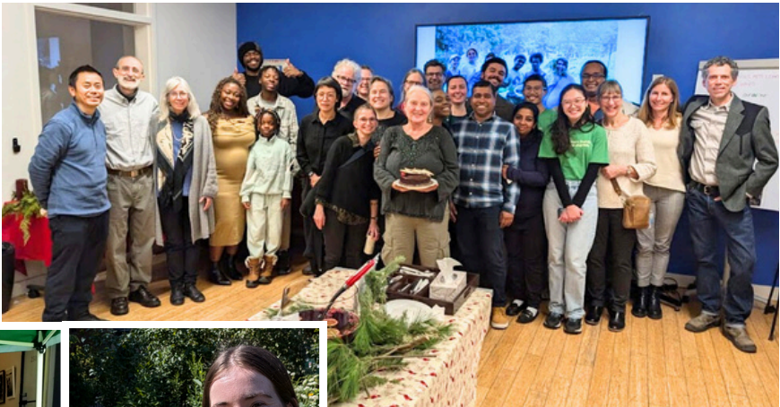
R: We had a grand time celebrating our 25 years with 25 (just so happened!) of our dear friends and family.